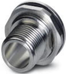
Housing screw connection, Plug, M12, Rear mounting, M15 x 1

Please be informed that the data shown in this PDF Document is generated from our Online Catalog. Please find the complete data in the user's documentation. Our General Terms of Use for Downloads are valid ( http://phoenixcontact.com/download )