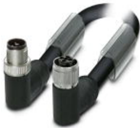
Power cable, 4-position, PUR halogen-free, black-gray RAL 7021, Plug angled M12, T-coded, on Socket angled M12, T-coded, cable length: 2 m

Please be informed that the data shown in this PDF Document is generated from our Online Catalog. Please find the complete data in the user's documentation. Our General Terms of Use for Downloads are valid ( http://phoenixcontact.com/download )