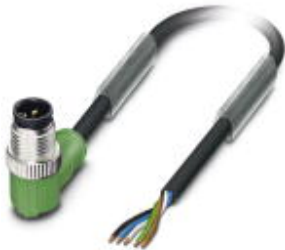
Sensor/Actuator cable, 5-position, PVC, black RAL 9005, Plug angled M12, A-coded, on free cable end, Cable length: 5 m

Please be informed that the data shown in this PDF Document is generated from our Online Catalog. Please find the complete data in the user's documentation. Our General Terms of Use for Downloads are valid ( http://phoenixcontact.com/download )