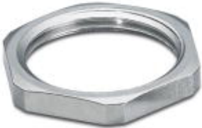
The figure shows version A-INL-M25-N-S

Counter nut, Cable gland material: Nickel-plated brass, Shielding: No, Connecting thread: 3/4" NPT, for threads 3/4 inch NPT, Color: silver