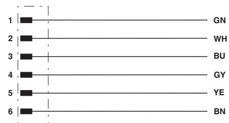
Contact assignment of 7/8" plug