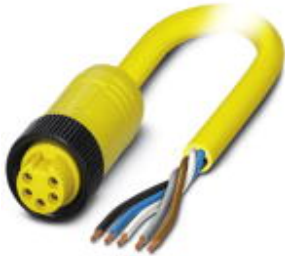
Power cable, 5-position, PVC, yellow, free cable end, on Socket straight 7/8"-16UNF, Cable length: 5 m

Please be informed that the data shown in this PDF Document is generated from our Online Catalog. Please find the complete data in the user's documentation. Our General Terms of Use for Downloads are valid ( http://phoenixcontact.com/download )