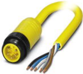
Power cable, 5-position, PVC, yellow, Plug straight 7/8"-16UNF, on free cable end, Cable length: 2 m

Please be informed that the data shown in this PDF Document is generated from our Online Catalog. Please find the complete data in the user's documentation. Our General Terms of Use for Downloads are valid ( http://phoenixcontact.com/download )