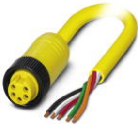
Power cable, 5-position, PVC, yellow, free cable end, on Socket straight 7/8"-16UNF, Cable length: 5 m

Please be informed that the data shown in this PDF Document is generated from our Online Catalog. Please find the complete data in the user's documentation. Our General Terms of Use for Downloads are valid ( http://phoenixcontact.com/download )