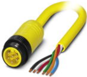
Power cable, 6-position, PVC, yellow, Plug straight 7/8"-16UNF, on free cable end, Cable length: 5 m

Please be informed that the data shown in this PDF Document is generated from our Online Catalog. Please find the complete data in the user's documentation. Our General Terms of Use for Downloads are valid ( http://phoenixcontact.com/download )