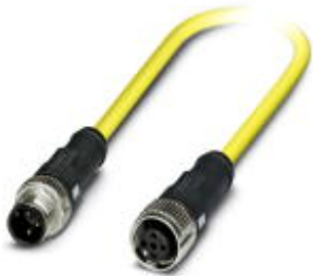
Sensor/Actuator cable, 3-position, PVC, yellow, Plug straight M12 SPEEDCON, A-coded, on Socket straight M12 SPEEDCON, A-coded, Cable length: 10 m

Please be informed that the data shown in this PDF Document is generated from our Online Catalog. Please find the complete data in the user's documentation. Our General Terms of Use for Downloads are valid ( http://phoenixcontact.com/download )