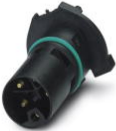
Flush-type connector, Power, 5-position, Plug, straight, L - Power, PCB mounting, THR solder connection

Please be informed that the data shown in this PDF Document is generated from our Online Catalog. Please find the complete data in the user's documentation. Our General Terms of Use for Downloads are valid ( http://phoenixcontact.com/download )