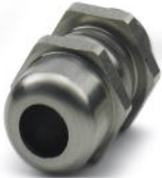
Cable gland, Cable gland material: Stainless steel 1.4305, External cable diameter 5 mm ... 10 mm, Shielding: No, Connecting thread: M16, Color: silver

Please be informed that the data shown in this PDF Document is generated from our Online Catalog. Please find the complete data in the user's documentation. Our General Terms of Use for Downloads are valid ( http://phoenixcontact.com/download )