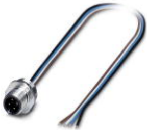
Bus system flush-type connector, FOUNDATION Fieldbus, plug, 4-pos., M12, A-coded, front/screw mounting with Pg9 thread, with 0.5 m TPE litz wire, 3 x 0.34 mm 2 , stainless steel version

Please be informed that the data shown in this PDF Document is generated from our Online Catalog. Please find the complete data in the user's documentation. Our General Terms of Use for Downloads are valid ( http://phoenixcontact.com/download )