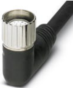
Socket M23, angled, 19-pos., with 15.5 m master cable

Please be informed that the data shown in this PDF Document is generated from our Online Catalog. Please find the complete data in the user's documentation. Our General Terms of Use for Downloads are valid ( http://phoenixcontact.com/download )