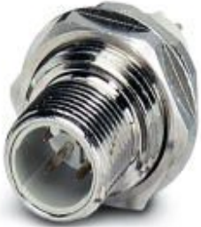
Sensor/actuator panel-mount connector, 4-pos., M12, A-coded, rear/screw mounting with Pg9 thread, with straight solder connection

Please be informed that the data shown in this PDF Document is generated from our Online Catalog. Please find the complete data in the user's documentation. Our General Terms of Use for Downloads are valid ( http://phoenixcontact.com/download )