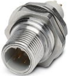
Sensor/Actuator flush-type plug, 5-pos., M12, B-coded, rear/screw mounting with Pg9 thread, with straight solder connection

Please be informed that the data shown in this PDF Document is generated from our Online Catalog. Please find the complete data in the user's documentation. Our General Terms of Use for Downloads are valid ( http://phoenixcontact.com/download )