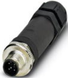
Sensor/actuator connector, straight, 5-pos., M12, A-coded, screw connection, metal knurl, cable gland Pg9 SKINTOP®

Please be informed that the data shown in this PDF Document is generated from our Online Catalog. Please find the complete data in the user's documentation. Our General Terms of Use for Downloads are valid ( http://phoenixcontact.com/download )