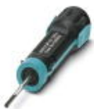
Assembly tool, for CK 1.6... crimp contacts for small conductor cross sections

Assembly tool - UNIFOX MT-CK 1.6/2.5 - 1089092