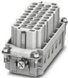
HEAVYCON socket insert, series: BB32, 32-pos., crimp connection, with plastic coding profile, can be coded

Please be informed that the data shown in this PDF Document is generated from our Online Catalog. Please find the complete data in the user's documentation. Our General Terms of Use for Downloads are valid ( http://phoenixcontact.com/download )