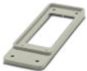
HEAVYCON adapter plate, type B24 on B16, for panel cutouts of type B24, gray

Adapter plate - HC-B 24-ADP-B 16-GY - 1660449