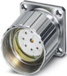
The figure shows the 9-pos. product version

Please be informed that the data shown in this PDF Document is generated from our Online Catalog. Please find the complete data in the user's documentation. Our General Terms of Use for Downloads are valid ( http://phoenixcontact.com/download )