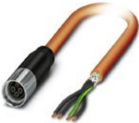
Cable plug in molded plastic, length: 2 m, color of outer sheath: orange RAL 2003

Please be informed that the data shown in this PDF Document is generated from our Online Catalog. Please find the complete data in the user's documentation. Our General Terms of Use for Downloads are valid ( http://phoenixcontact.com/download )