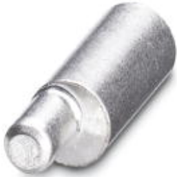
Cable lug for HEAVYCON-MODULAR; PE connection extension to 16 mm 2 , for crimping with crimp pliers

Please be informed that the data shown in this PDF Document is generated from our Online Catalog. Please find the complete data in the user's documentation. Our General Terms of Use for Downloads are valid ( http://phoenixcontact.com/download )