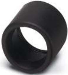
Seal, outside, to increase the degree of protection, size M40

Please be informed that the data shown in this PDF Document is generated from our Online Catalog. Please find the complete data in the user's documentation. Our General Terms of Use for Downloads are valid ( http://phoenixcontact.com/download )