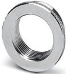
Reducing adapter, M40 on M32, incl. O-ring

Please be informed that the data shown in this PDF Document is generated from our Online Catalog. Please find the complete data in the user's documentation. Our General Terms of Use for Downloads are valid ( http://phoenixcontact.com/download )