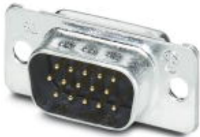
D-SUB contact insert, shell size 1, with 15 signal contacts, type of contact pin, with solder cup, straight, fixing with a 3 mm hole, for panel mounting frame VS-09-...

Please be informed that the data shown in this PDF Document is generated from our Online Catalog. Please find the complete data in the user's documentation. Our General Terms of Use for Downloads are valid ( http://phoenixcontact.com/download )