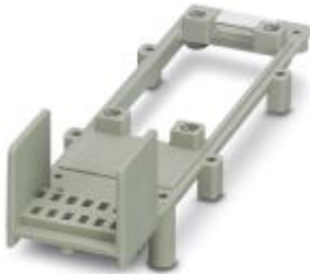
Plug receptacle, for plug assembly board, with strain relief, for accommodating contact inserts, type B16

Please be informed that the data shown in this PDF Document is generated from our Online Catalog. Please find the complete data in the user's documentation. Our General Terms of Use for Downloads are valid ( http://phoenixcontact.com/download )