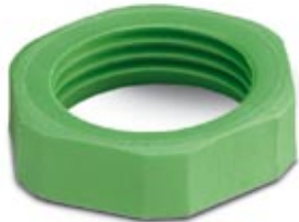
Nut (plastic) to lock the contact carrier Pg13.5 / 27 WAF

Please be informed that the data shown in this PDF Document is generated from our Online Catalog. Please find the complete data in the user's documentation. Our General Terms of Use for Downloads are valid ( http://phoenixcontact.com/download )