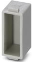
Dummy module, for vacant slots in the metal retaining frame

Please be informed that the data shown in this PDF Document is generated from our Online Catalog. Please find the complete data in the user's documentation. Our General Terms of Use for Downloads are valid ( http://phoenixcontact.com/download )