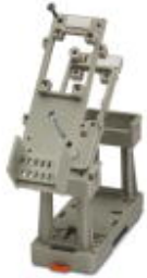
HEAVYCON connector assembly frame, for contact inserts of type B16

Please be informed that the data shown in this PDF Document is generated from our Online Catalog. Please find the complete data in the user's documentation. Our General Terms of Use for Downloads are valid ( http://phoenixcontact.com/download )