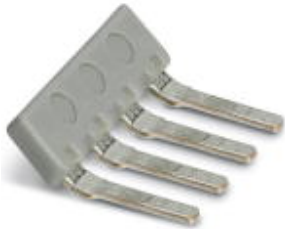
Insertion bridge for plugs featuring a screw connection with a 3.81 mm pitch

Please be informed that the data shown in this PDF Document is generated from our Online Catalog. Please find the complete data in the user's documentation. Our General Terms of Use for Downloads are valid ( http://phoenixcontact.com/download )