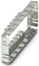
EMC shield adapter, for EMC connector, type 2, number of insert modules 3

Please be informed that the data shown in this PDF Document is generated from our Online Catalog. Please find the complete data in the user's documentation. Our General Terms of Use for Downloads are valid ( http://phoenixcontact.com/download )