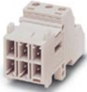
Contact insert module, for panel mounting frames, with screw connection, 6-pos., 250 V / 10 A

Please be informed that the data shown in this PDF Document is generated from our Online Catalog. Please find the complete data in the user's documentation. Our General Terms of Use for Downloads are valid ( http://phoenixcontact.com/download )