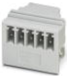
PCB headers, number of positions: 5, pitch: 3.5 mm, color: light gray, contact surface: Tin, pin layout: Linear pinning, solder pin [P]: 2 mm, Article with lateral pin exit

Feed-through header - MCO 1,5/ 5-G1L-3,5 KMGY - 2278380