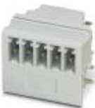
PCB headers, number of positions: 5, pitch: 3.5 mm, color: light gray, contact surface: Tin, pin layout: Linear pinning, solder pin [P]: 2 mm, Article with lateral pin exit

Feed-through header - MCO 1,5/ 5-G1R-3,5 KMGY - 2278351