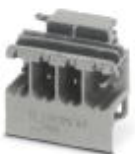
PCB headers, number of positions: 4, pitch: 5 mm, color: light gray, contact surface: Tin, pin layout: Linear pinning, Article with lateral pin exit

Feed-through header - MSTBO 2,5/ 4-G1PL GY7035 - 2200325