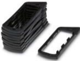
EMC seal for HC-ALU panel mounting base

Please be informed that the data shown in this PDF Document is generated from our Online Catalog. Please find the complete data in the user's documentation. Our General Terms of Use for Downloads are valid ( http://phoenixcontact.com/download )