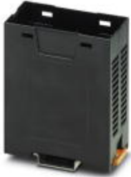
DIN rail housing, Lower housing part with base latch, tall design, with vents, width: 35.1 mm, color: black (9005)

Please be informed that the data shown in this PDF Document is generated from our Online Catalog. Please find the complete data in the user's documentation. Our General Terms of Use for Downloads are valid ( http://phoenixcontact.com/download )