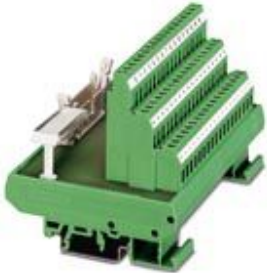
VARIOFACE module, for mounting on NS 35/7.5 or NS 32, for connecting 16 proximity switches

Please be informed that the data shown in this PDF Document is generated from our Online Catalog. Please find the complete data in the user's documentation. Our General Terms of Use for Downloads are valid ( http://phoenixcontact.com/download )