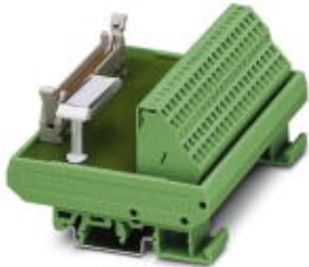
Standard 1:1 FLK module, with spring-cage connection and flat-ribbon cable connector, no. of positions 26

Please be informed that the data shown in this PDF Document is generated from our Online Catalog. Please find the complete data in the user's documentation. Our General Terms of Use for Downloads are valid ( http://phoenixcontact.com/download )