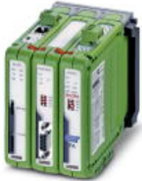
PROFIBUS DP to PROFIBUS PA coupler

Please be informed that the data shown in this PDF Document is generated from our Online Catalog. Please find the complete data in the user's documentation. Our General Terms of Use for Downloads are valid ( http://phoenixcontact.com/download )