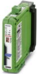
PROFIBUS PA interface module with oscilloscope

Please be informed that the data shown in this PDF Document is generated from our Online Catalog. Please find the complete data in the user's documentation. Our General Terms of Use for Downloads are valid ( http://phoenixcontact.com/download )