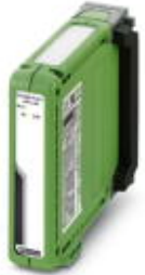
PROFIBUS power module

Please be informed that the data shown in this PDF Document is generated from our Online Catalog. Please find the complete data in the user's documentation. Our General Terms of Use for Downloads are valid ( http://phoenixcontact.com/download )