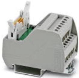
VARIOFACE interface module, with LED, for 8 channels

Please be informed that the data shown in this PDF Document is generated from our Online Catalog. Please find the complete data in the user's documentation. Our General Terms of Use for Downloads are valid ( http://phoenixcontact.com/download )