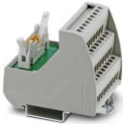
VARIOFACE sensor module, for connecting 8 pnp sensors

Please be informed that the data shown in this PDF Document is generated from our Online Catalog. Please find the complete data in the user's documentation. Our General Terms of Use for Downloads are valid ( http://phoenixcontact.com/download )