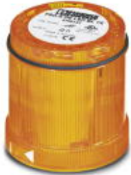
LED blinking light element, 24 V AC/DC, yellow

Please be informed that the data shown in this PDF Document is generated from our Online Catalog. Please find the complete data in the user's documentation. Our General Terms of Use for Downloads are valid ( http://phoenixcontact.com/download )