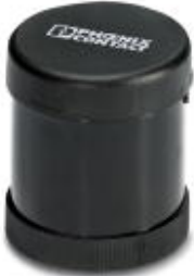
Siren element, 7 tones, 24 V DC, max. 100 dB(A), tone range over 3 signal lines, black

Please be informed that the data shown in this PDF Document is generated from our Online Catalog. Please find the complete data in the user's documentation. Our General Terms of Use for Downloads are valid ( http://phoenixcontact.com/download )