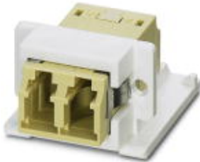
Coupling, LC/LC, can be used for multi-mode glass fibers

Please be informed that the data shown in this PDF Document is generated from our Online Catalog. Please find the complete data in the user's documentation. Our General Terms of Use for Downloads are valid ( http://phoenixcontact.com/download )