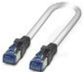
Patch cable, CAT6, pre-assembled, 15.0 m

Patch cable - FL CAT6 PATCH 15,0 - 2891372