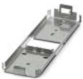
Mounting plate for Axioline E metal devices