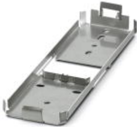
Mounting plate for Axioline E metal devices

Please be informed that the data shown in this PDF Document is generated from our Online Catalog. Please find the complete data in the user's documentation. Our General Terms of Use for Downloads are valid ( http://phoenixcontact.com/download )