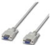
RS-232 cable, 9-pos. D-SUB socket on 9-pos. D-SUB socket, 9-wire, 1:1

Data cable - PSM-KA9SUB9/BB/2METER - 2799474