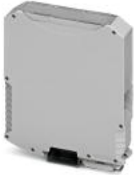
DIN rail housing, Complete housing with metal foot catch, tall design, without vents, width: 22.5 mm, color: light gray (7035)

Please be informed that the data shown in this PDF Document is generated from our Online Catalog. Please find the complete data in the user's documentation. Our General Terms of Use for Downloads are valid ( http://phoenixcontact.com/download )