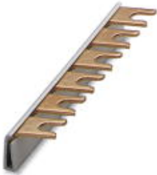
Wiring bridge for modules with connecting pitch 17.5 mm, 1-phase, 6-pos.

Please be informed that the data shown in this PDF Document is generated from our Online Catalog. Please find the complete data in the user's documentation. Our General Terms of Use for Downloads are valid ( http://phoenixcontact.com/download )